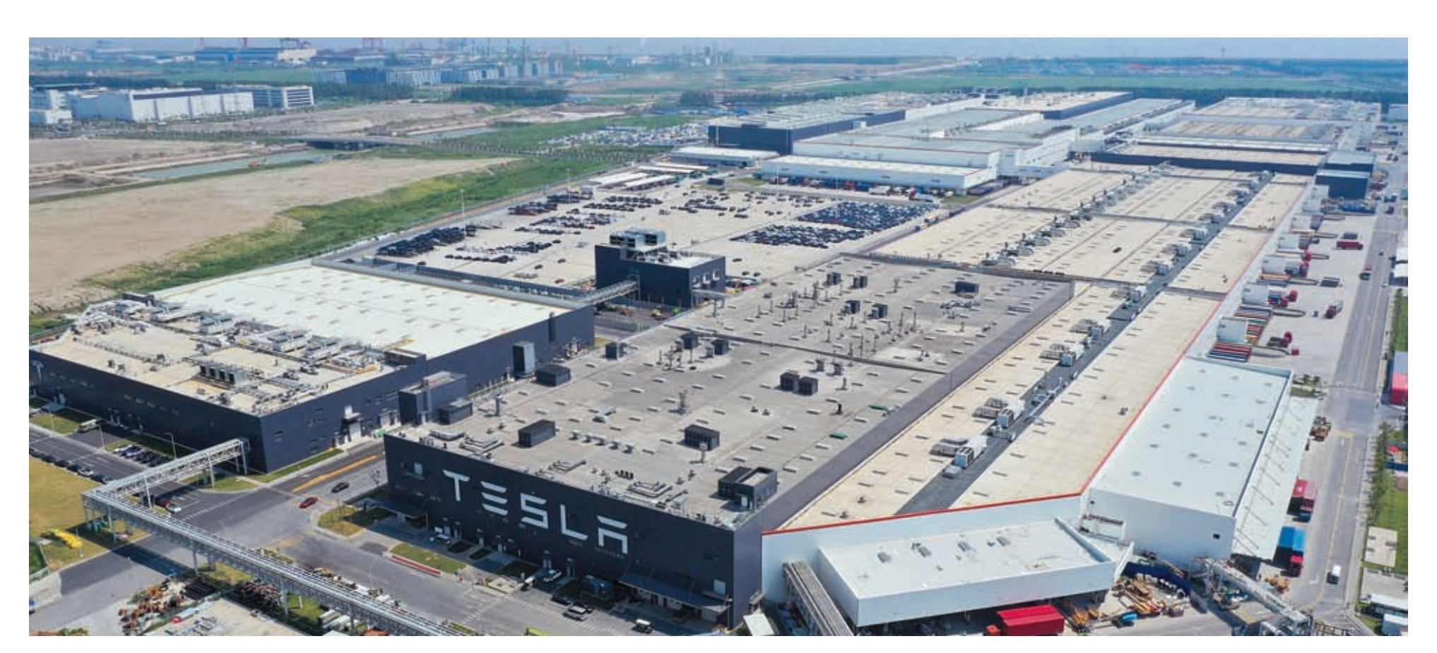
A bird's-eye view of the Tesla Gigafactory in Shanghai in August 2022.